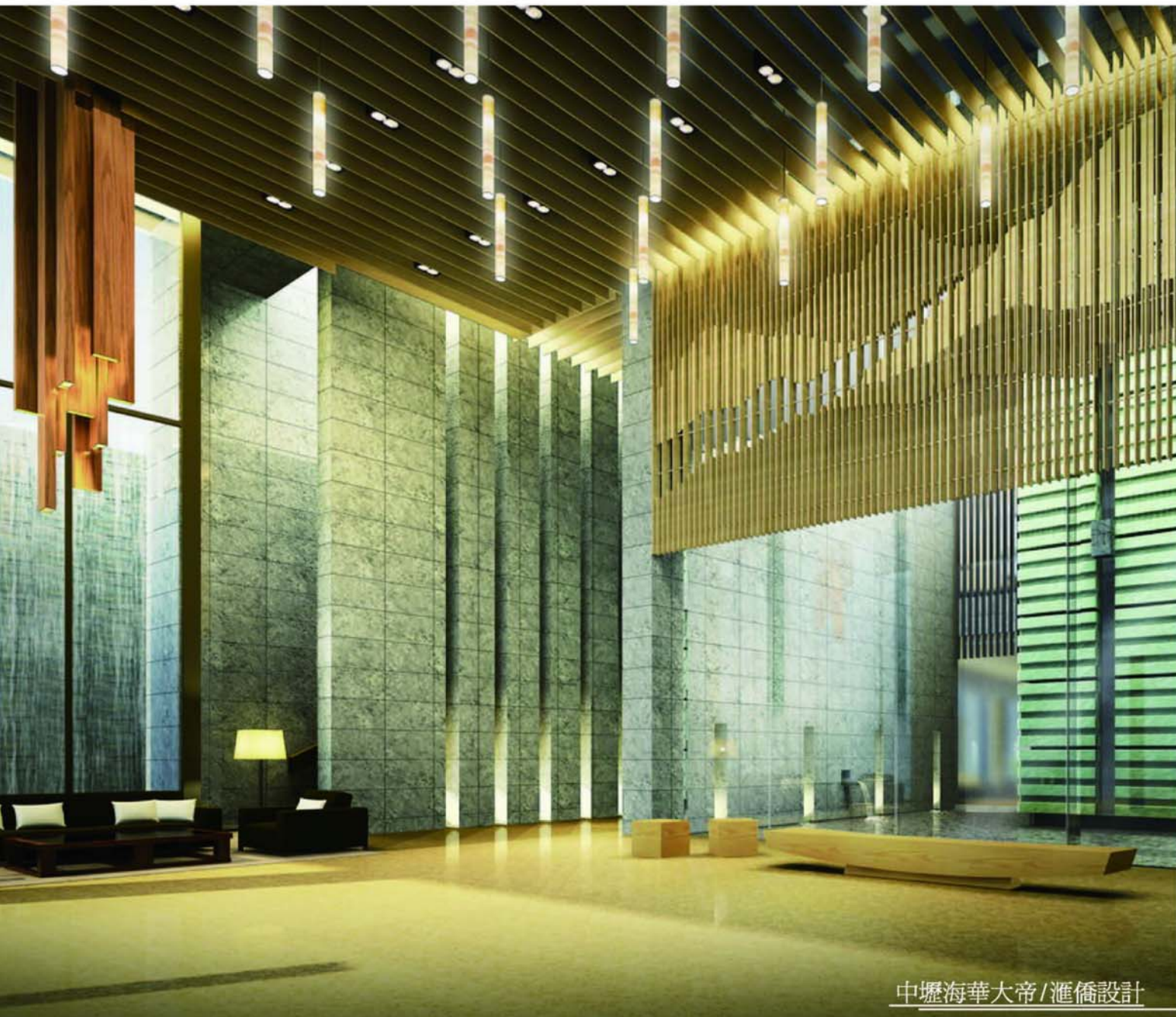
中壢海華大帝 / 滙僑設計